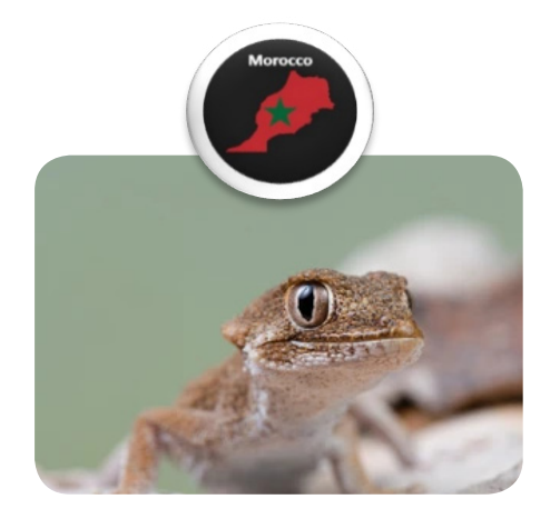
Poachers target the helmethead gecko Tarentola chazaliae