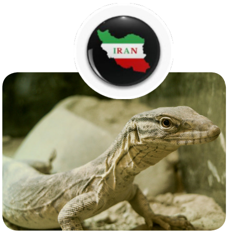
Iran is home to 332 reptile species, of which 58 species are endemic